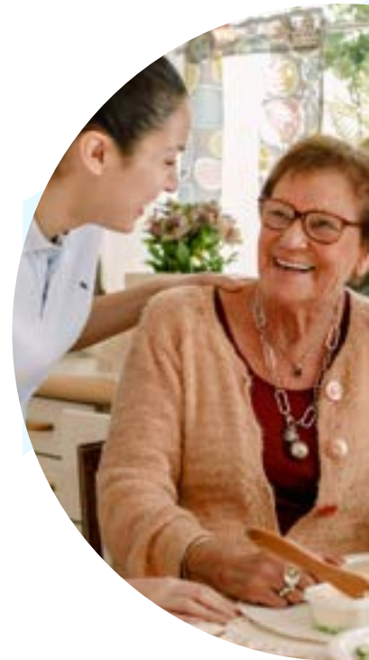
Illustration is for financial professional educational purposes only and assumes a borrower aged 62 who resides in Tennessee and an adjustable interest rate, with an initial rate of 6.8% (+0.50% MIP), and financed fees of approximately 3.3% of the home value. Rate quote generated on 7/15/2024. Rates are rounded to the nearest 0.125% and are subject to change.